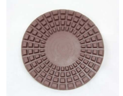
8" Cheetah Rigid Pads