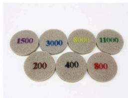
8" Monkey Pads