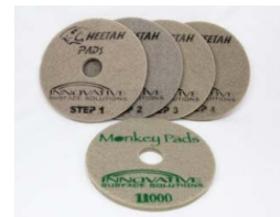
8" Cheetah Pads